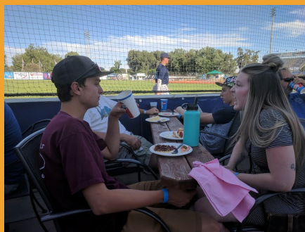
The whole Renaissance Remodeling group was present