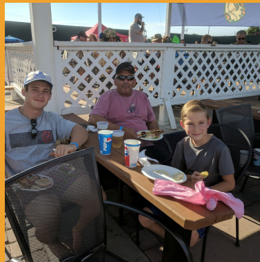
The Levco crowd!!